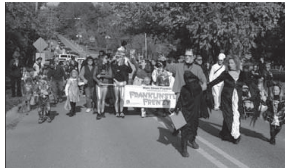
Princesses, ghosts, goblins, chefs, robots, reapers and shiny tights galore! Franklin residents of all ages turned out in fine form for this year's Franklins Frenzy.