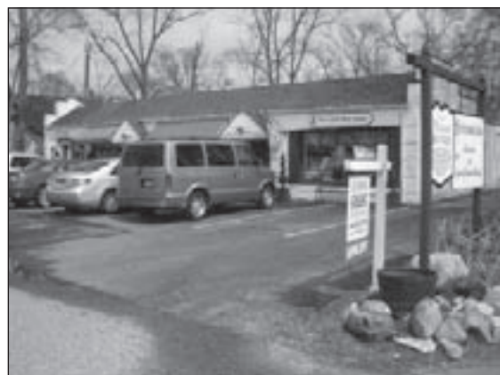
“Village Plaza” or Jones Building, before

MSF is pleased to be a part of the wonderful things that are creating value in the historic Village Center and to our residents at large, from the Farmers Market, DIA Inside|Out program and Franklinstein, to the beautification of our historic buildings. Look for more exciting things to come!