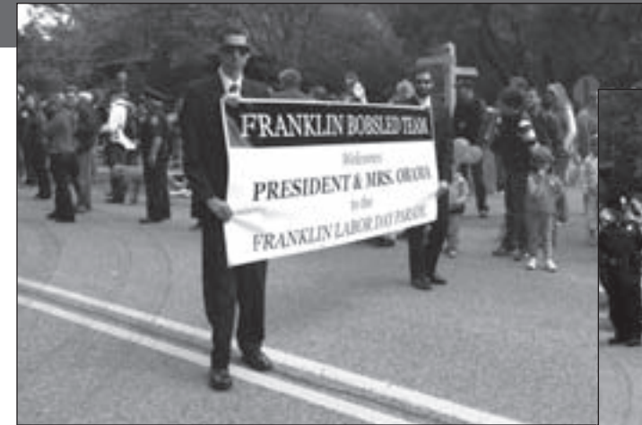
Labor Day Round Up 2011 was a huge success this year, and parade-goers were surprised by an unannounced visit from President and Mrs. Barack Obama*, sponsored by the Franklin Bobsled Team.