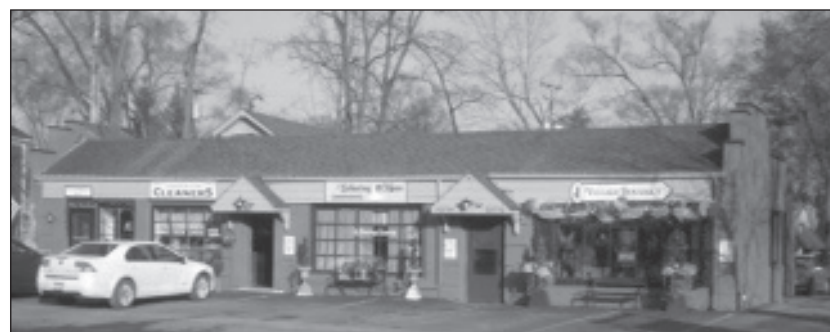
“Village Plaza” or Jones Building, after