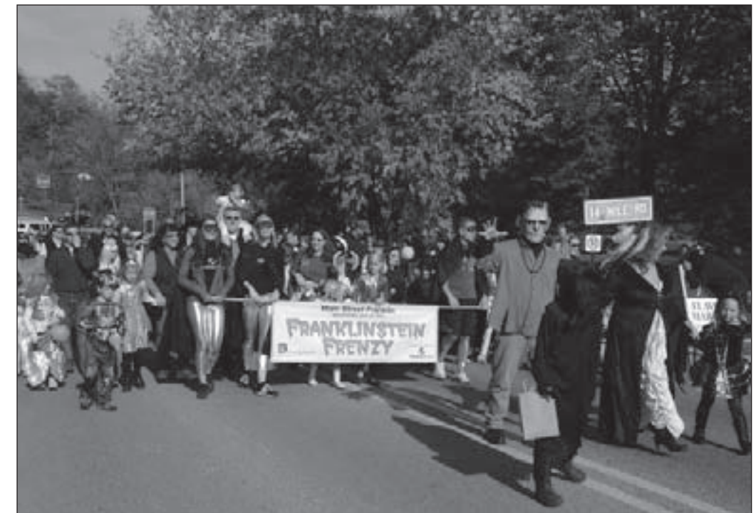
The 2nd Annual Franklinsien Frenzy 2011 was a monstrous success this year! Franklinites of all ages dressed in costume and took to terrorizing the streets in parade form. Residents enjoyed trick-or-treating, a haunted room at Gorback Fine Photography, apple bobbing, face painting, Looney Bin coffin races and a bonfire. More photos on page 3.